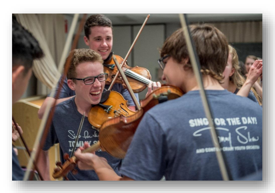
Contemporary Youth Orchestra.

Support Material: recent, relevant and quality evidence submitted by the applicant that demonstrates alignment with funding criteria and supports written narrative. Includes print, video, audio and visual materials. For more detailed information, please see the Support Materials Guide .