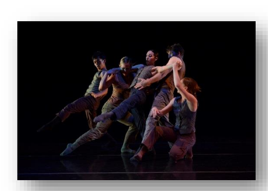
GroundWorks DanceTheater has been a GOS recipient since 2008.