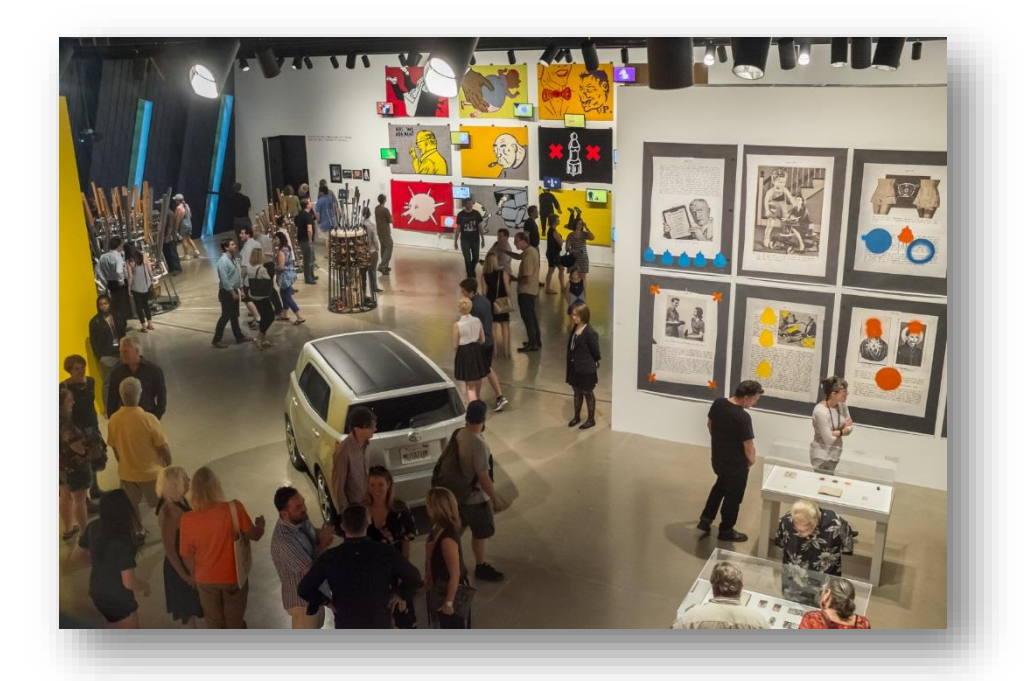
Museum of Contemporary Art (MOCA) Cleveland.

The Statement of Assurances is the last step in the application process. An authorizing official will certify that s/he is authorized to submit the application on behalf of the organization and that the information submitted in the application is true and correct to the best of his/her knowledge.